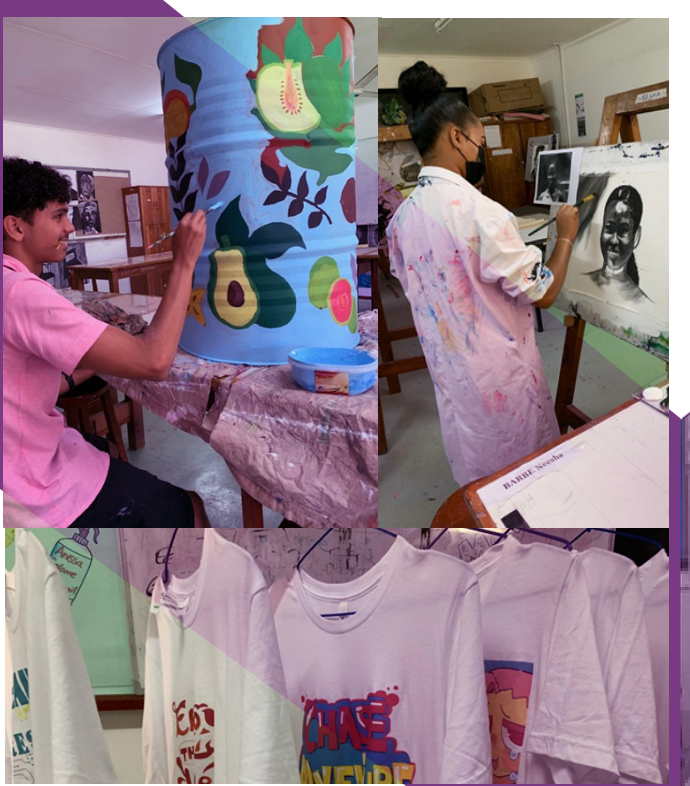
Seychelles Institute of Art and Design

Teacher assistant in related field at primary level, Entrepreneur, assistant to Visual Arts designers, craft persons, assistant to photographer and artists.